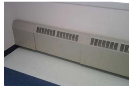
Example of radiator with cover

Repeat these measurement procedures for each heating unit. Now you are ready to size your Heat Reflectors.